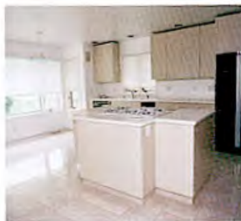
Above and left: This bland 1950s kitchen is brought to life with cherry woodwork, stained glass artwork and pendant lighting.

Recessed downlights, ornate wall sconces, antique lamps, and pendant