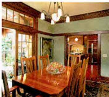
Right: The dining room opens into the conservatory and the living room, with views of the lake visible from all three.