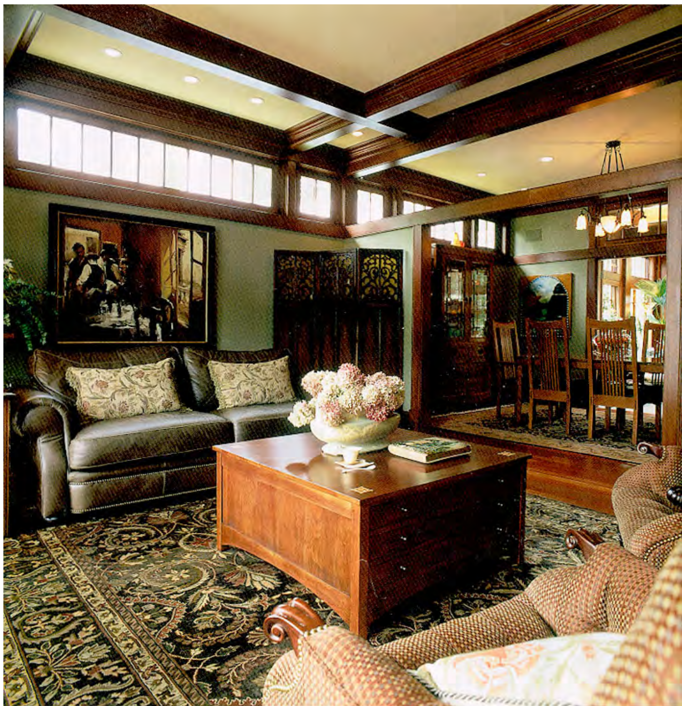
Above: The interiors feature cherry woodwork and solid wood beams.